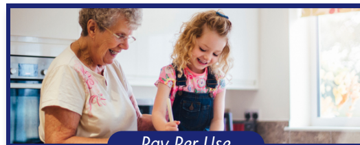
Pay Per Use